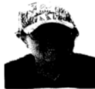
Joe of Jericho Building/set